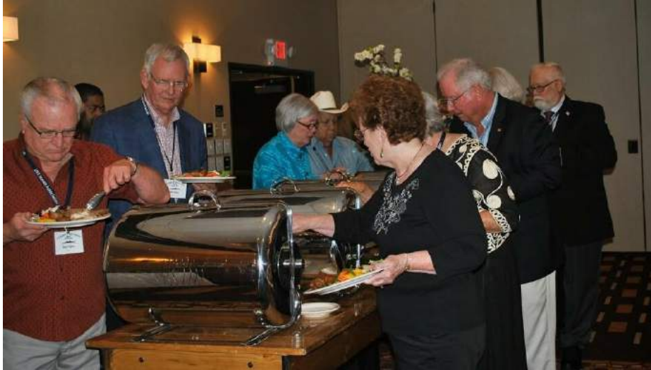
Guests pass through the buffet line