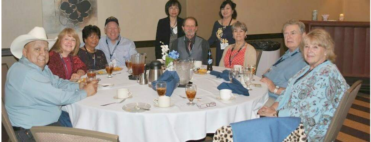
Reunion guests looking good for the camera