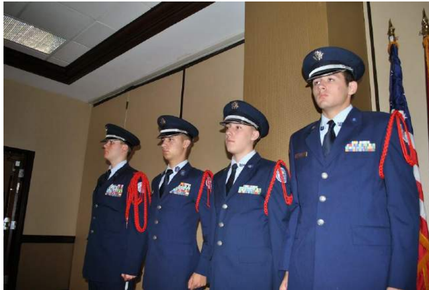
Branson High School AFJROTC Color Guard