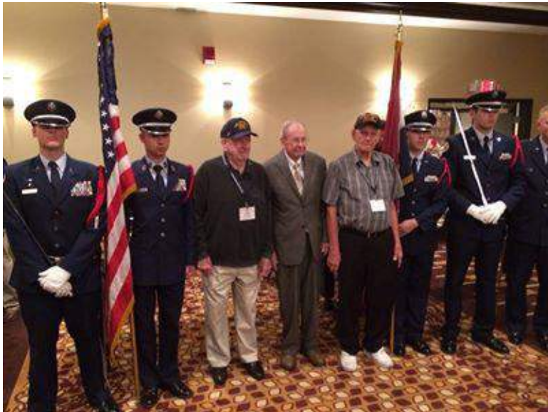
Our DD 407 shipmates with the Branson HS AF JROTC Color Guard

I believe I speak for all the Association members when I say it is our DD 407 shipmates that honor all of us, just by their presence at the reunions.