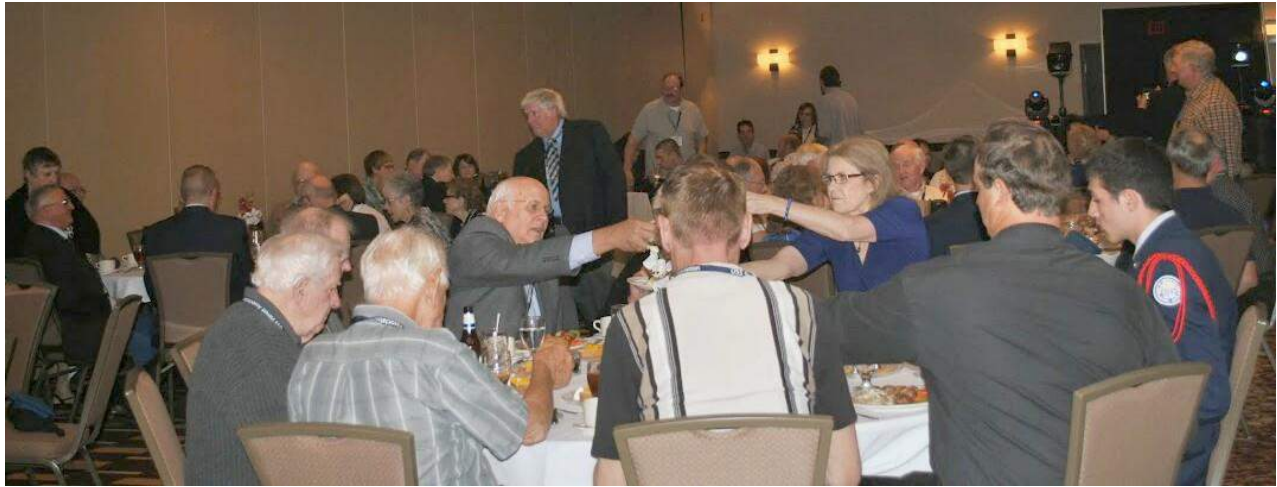
DD 407 Shipmates with ROTC Color Guard