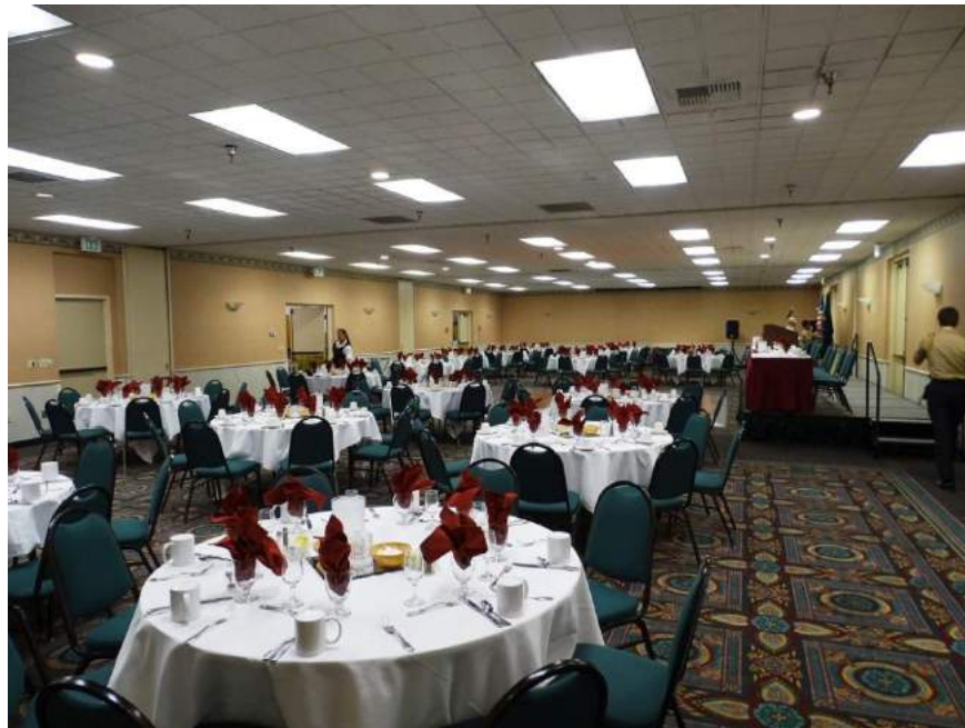
The mess decks never looked so good