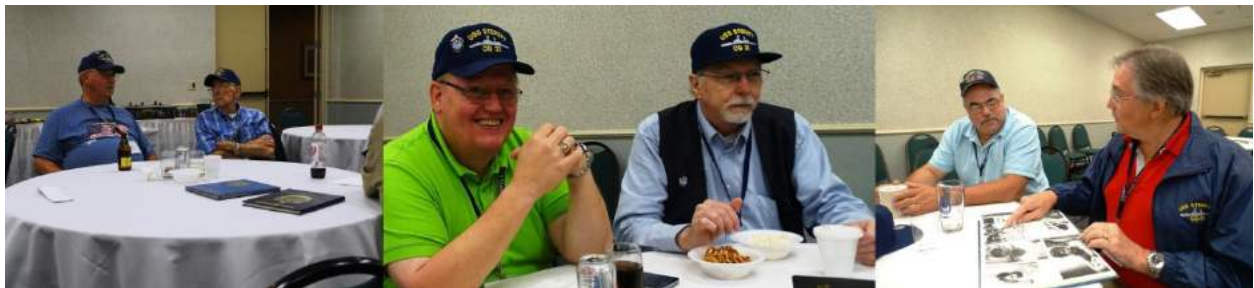
Shipmates catch up after many years