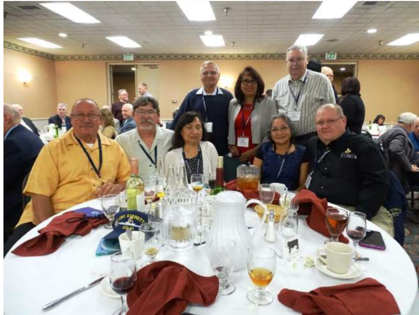
Operations Department muster