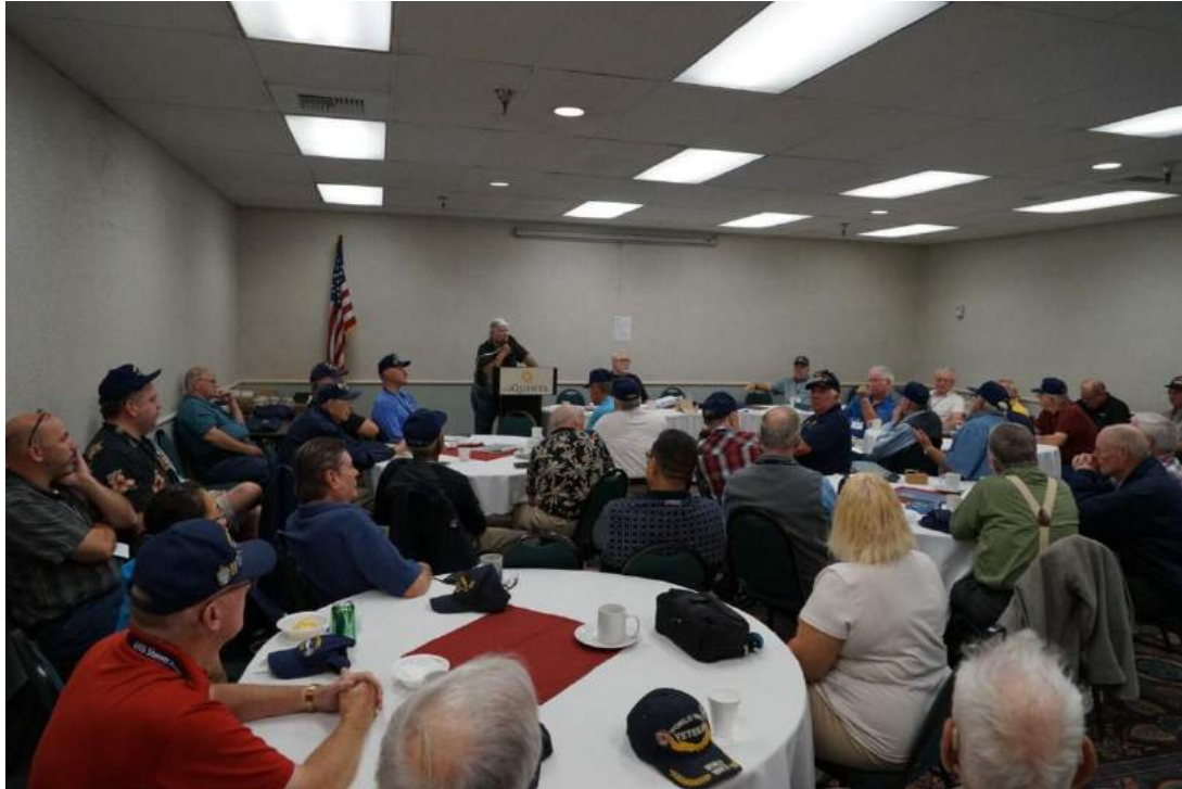
Members discuss Association business Saturday morning

I received the following letter from the USS Turner Joy Museum: