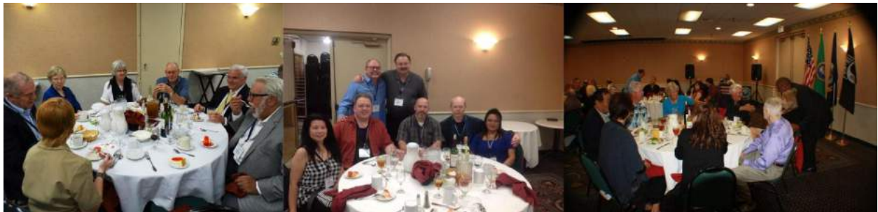
Good food, good folks, good times