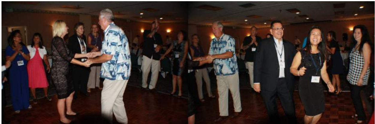
Working off that good chow