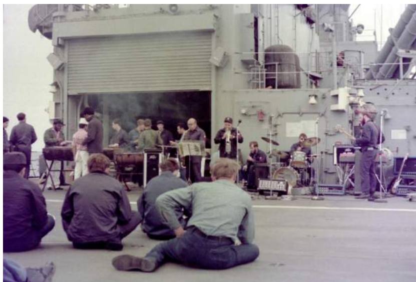
Steel Beach Picnic