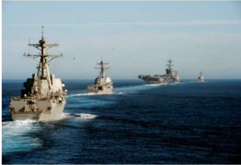
USS Sterett (DDG-104) leads the way on a show of force transit training exercise with USS Dewey (DDG-105), USS Wayne E. Meyer (DDG-108), USS Carl Vinson (CVN-70) and USS O'Kane (DDG-77) on Nov. 4, 2016.

As these pictures reveal, regardless of the latest technologies, some shipboard evolutions haven't changed over the years.