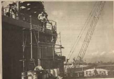
MAINTENANCE AND REPAIR PERIOD, 1990 SUBIC BAY, REPUBLIC OF PHILIPPINES

MARCH - APRIL 1990 Serving Family and Friends of Sterett Vol. 3, No. 2