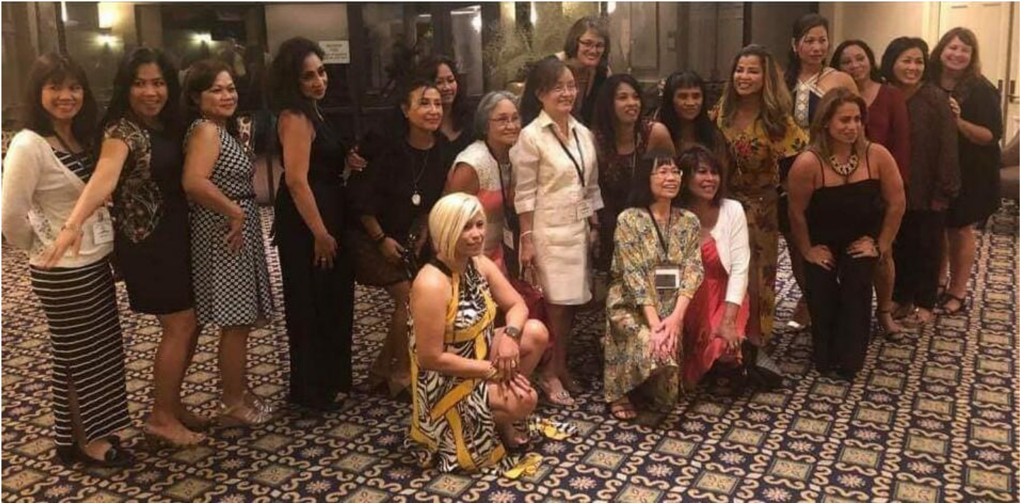
The ladies added charm and beauty to the reunion