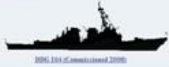
DDG-104 (Commissioned 2000)