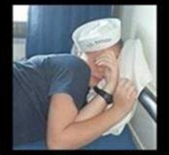
What my Chief thought I did.