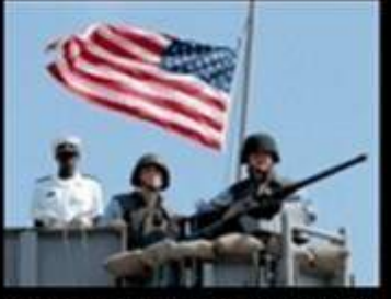
What society thought I did.