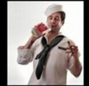
What my friends thought I did.