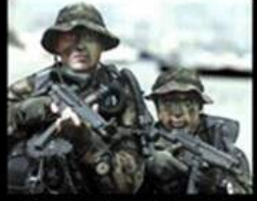
What I tell people I did.