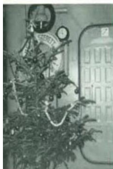
“CHRISTMAS IN YOKOSUKA 1969”