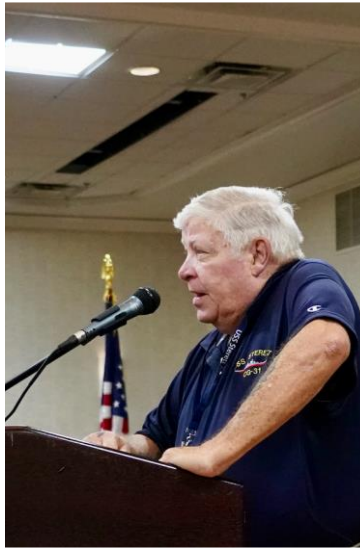
USS STERETT Association Memorial Service June 26, 2017, in Nashville, Tennessee