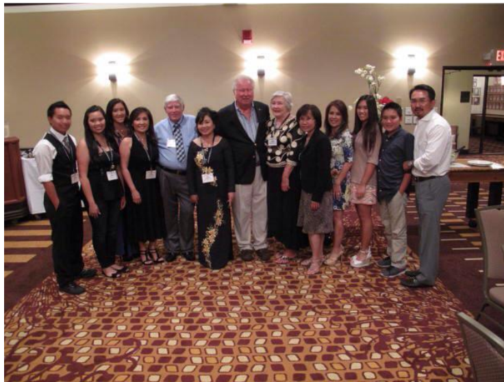
2013 Branson Missouri Reunion

Master Chief, E-9, the top of the senior enlisted. A leader and a developer of his future Navy. Yes, every Ensign and every Seaman Apprentice owes a great debt to the Chief who gently, or perhaps not too gently, encourages them to become a better Sailor. A better steward of the legacy that is the United States Navy.