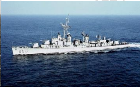
USS Higbee DD-806

That day the designated targets were to be a radar installation, a petroleum storage area, the Dong Hoi airfield, coastal gun emplacements, and an ammunition cache at Cap Lay.