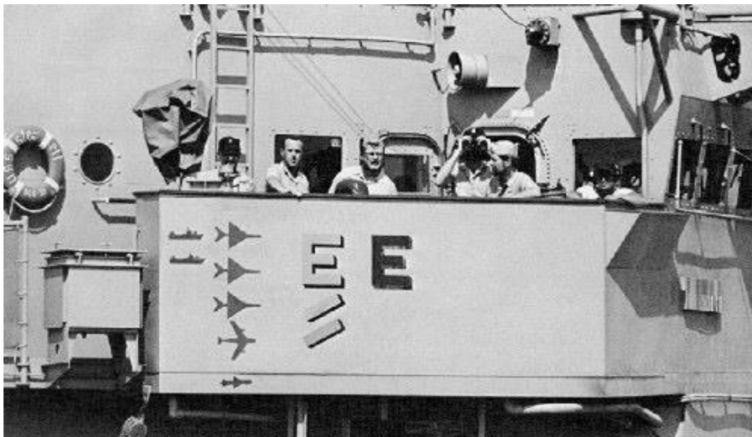
Starboard bridge wing of USS Sterett - Gulf of Tonkin - 1972 with "kill" symbols

To this day, several of Sterett's crew who were not in CIC do not have much knowledge of the brief battle that Sterett fought that day. Anyone who did not have a "need to know" was virtually kept in the dark. These orders from higher command came as a shock to the CIC, missile, and gun crews. It was as if it was Sterett's destiny of being robbed of the credit she so rightly deserved. The ship did receive the Naval Unit Commendation but not the coveted Presidential Citation.