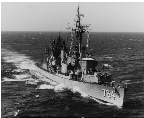
USS Lloyd Thomas DD-764