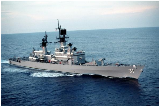
USS Sterett DLG-31