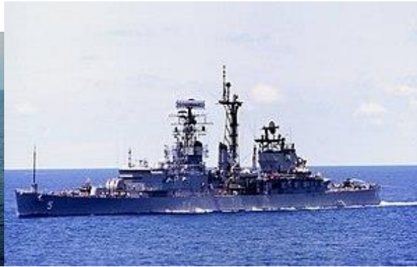
USS Oklahoma City CLG-5